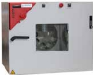
20-2572 旋转薄膜烘箱 RTFOT Rolling Thin Film Oven RTFOT