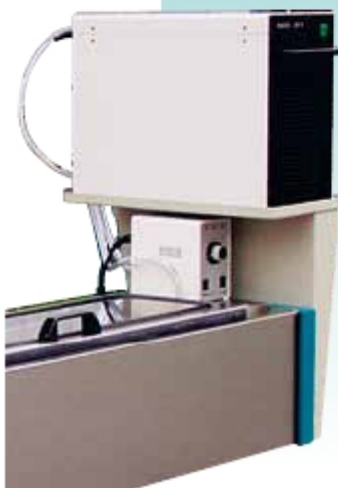
20-2375 与延度仪连接的冷却装置具有浸没式加热器 50-0600/50-0610，可进行-5°C 至大约 80°C 环境下的试验。